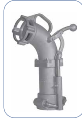
6200X, 6400X, 6500X

3" taller than the standard 6200, 6400 or 6500 elbows